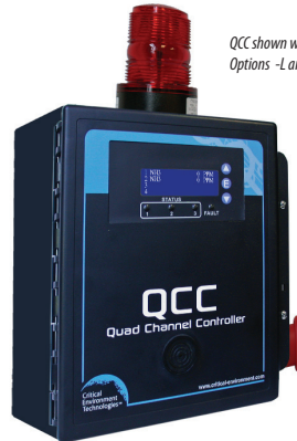
QCC shown with Options -L and -SW.