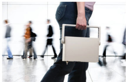
YES Plus LGA (picture above) is housed in a rugged ABS enclosure with swivel handle to act as a stand support or for carrying the instrument.